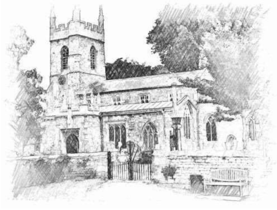
Church of St Peter ad Vincula